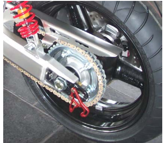
KTS-BN black with red lifter

By exact guidance of the rear axle the screw down of the rear axle nut does not tighten the driving chain subsequently.