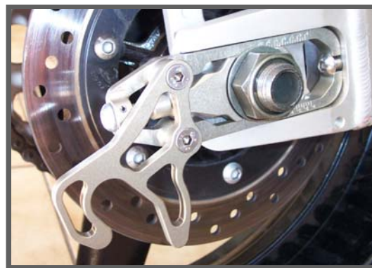
View: KTS-RJ03 with lifter, right side