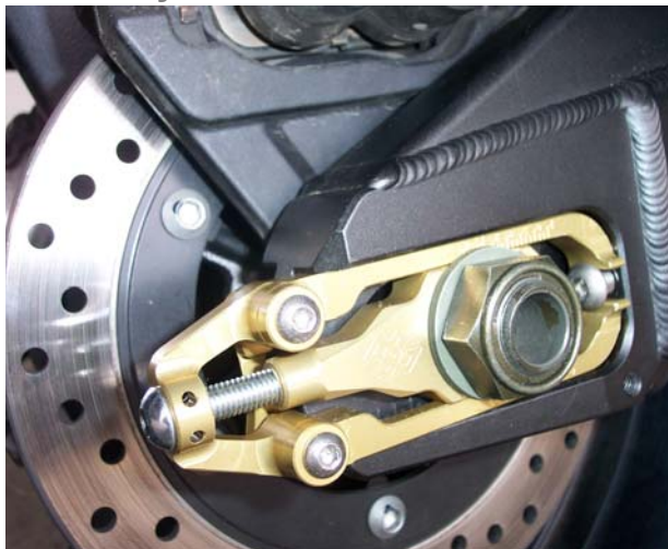
View: KTS-RN09 guidance part with slider and adjusting bolt