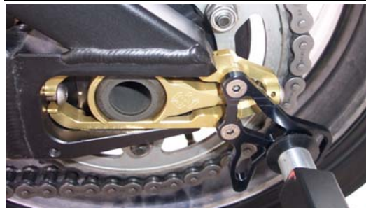
View: KTS-RN09 guidance part with lifter and adjusting bolt (optional), in paddock rack