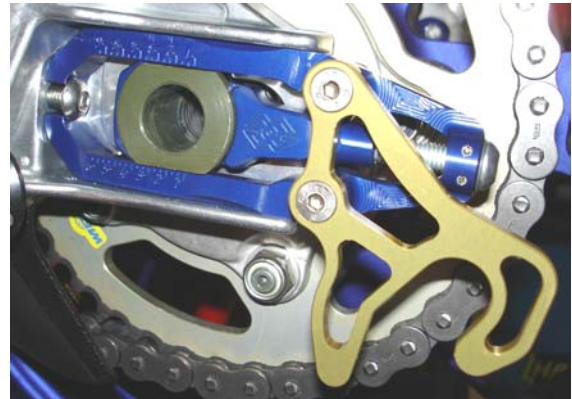
KTS-RR blue with gold lifter