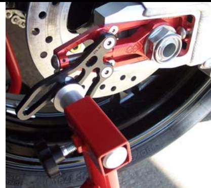
View: KTS-SC57 guidance part with lifter and adjusting bolt (optional) in paddock rack