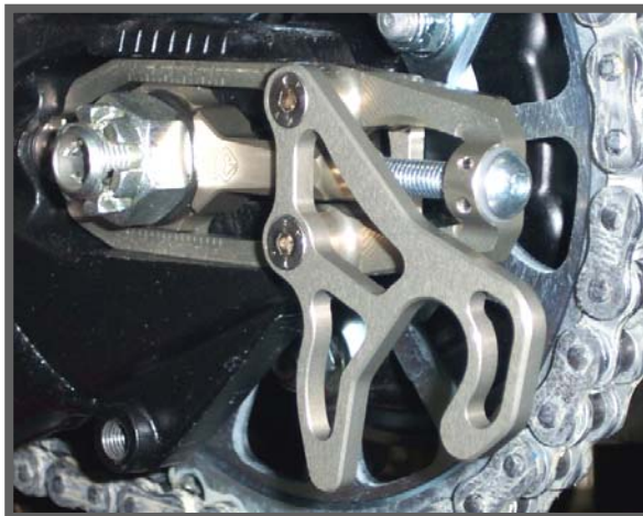
KTS-ZXT00A titan with lifter