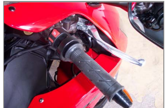
View maximum height at minus 4°: +40 mm