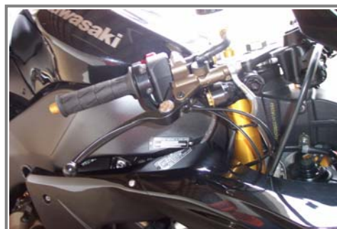
View maximum height at minus 4°: +55 mm